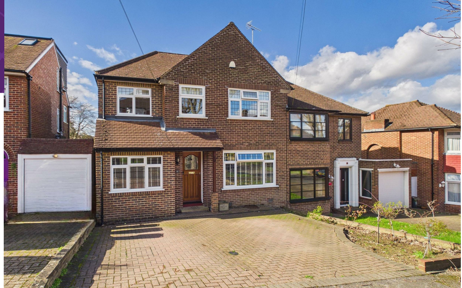
EST 1973 Paul Meakin ESTATE AGENTS Guide Price £635,000 Eskdale Gardens, Purley, CR8 1EY